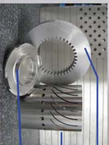
WIRE EDM GEAR SINKER EDM HOLE POP

We are able to help you determine the best process, whether it's EDM or Waterjet, to help meet your production objective.